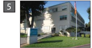
5 Specialty Clinics LosserviciosincluyenOtorrinolar- ingología,Neurología,Oncología, Gastroenter-ología,Ortopedia,HepC, MinorPorcedures,Podiatría,Cirugía, Neurocirugía, Ophthalmología, y Urología.Requierereferenciadesu médico primario. No escala flexible de costos disponibles. 830-B Scenic Drive Modesto, CA 95350