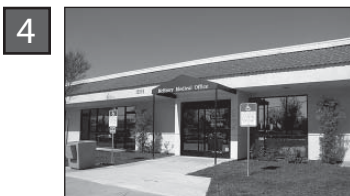
4 McHenry Medical Office High Risk OB Services, Teen Clinic 1209 Woodrow Ave. Suite B-10 Modesto, CA 95350 558-5312