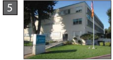
5 Specialty Clinics Services include ENT, Neurology, Oncology, GI, Orthopedics, Podiatry, HepC, Minor Procedures, Urology, Neurosurgery and Ophthalmology. Requires referral. No Slide Fee Scale Available. 830-B Scenic Drive Modesto, CA 95350