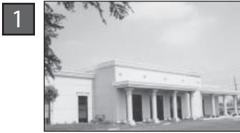
1 Ceres Medical Office 3109 Whitmore Avenue Ceres, CA 95307 541-2929