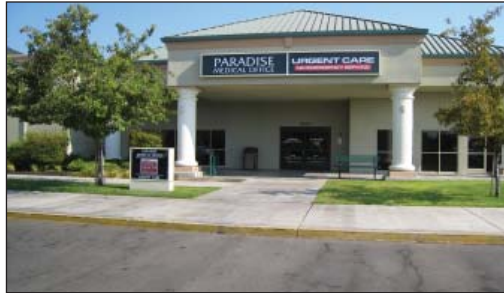
401 Paradise Road, Modesto 558-7000 Hours: 5:30 pm - 9:30 pm, Monday - Friday 10:00 am - 6:00 pm, Saturday and Sunday