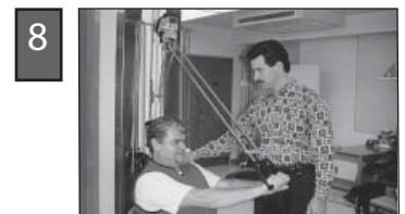
8 Servicios de Rehabilitación Terapia Física, del lenguaje y laboral,Cuidado para heridas,y Servicios de Audiología. No escala flexible de costos disponibles. 830-B Scenic Drive Modesto, CA 95350 558-7000