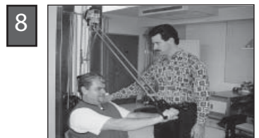
8 Rehabilitation Services Physical, Speech & Occupational Therapies, Wound Care and Audiology Services. No Slide Fee Scale Available. 830-B Scenic Drive Modesto, CA 95350 558-7000