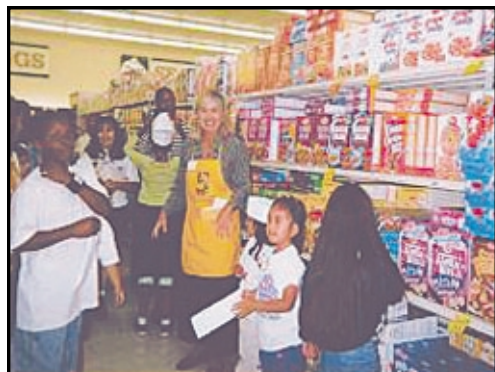
Learning to read food labels during "Kids Off the Couch" Program.

Childhood obesity has reached epidemic proportions in the nation. To address this problem, the theme of the National Public Health Week (April 7-13) this year is overweight and obesity. Overweight children become sick more often, perform more poorly in school, are at heightened risk for a number of chronic childhood diseases and conditions, and are increasingly being diagnosed with "adult" diseases, such as type 2 diabetes, high blood pressure, and increased blood cholesterol. In addition, overweight children often experience discrimination and stigmatization by society and their peers, which contribute to psychological stress and low self esteem.